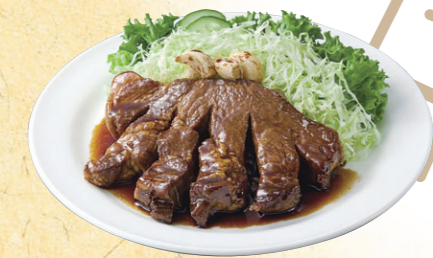
Local's favorite food Yokkaichi Tonteki is sautéed pork, and local's favorite food. It is fried thick pork meat with garlic and source.