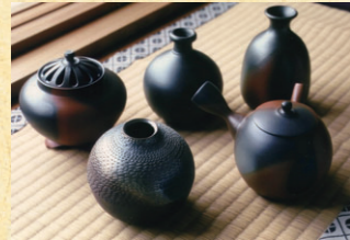
Yokkaichi Banko ware (Local product)