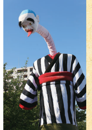
Prefecturally-Designated Cultural Property - Mechanical Doll "O-nyudo"